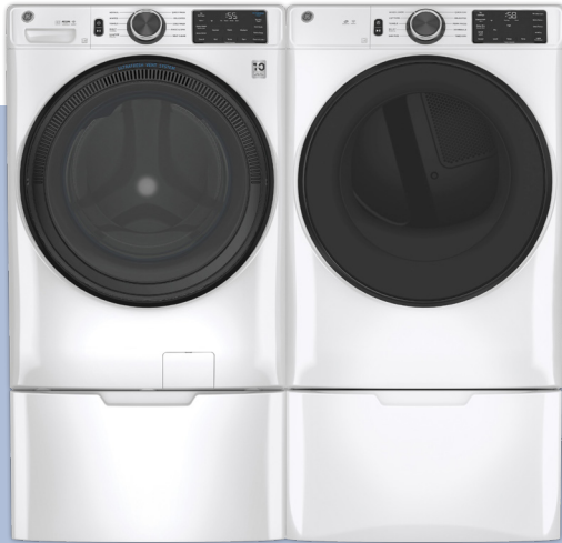
GFD55ESSN (Long Vent)

DIMENSIONS (WITHOUT PEDESTAL): 39-3/4" H x 28" W x 39-3/4" D